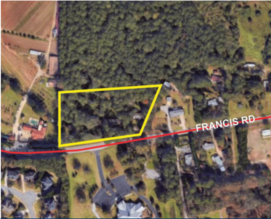
3340 Francis Road | Alpharetta, Georgia 30004