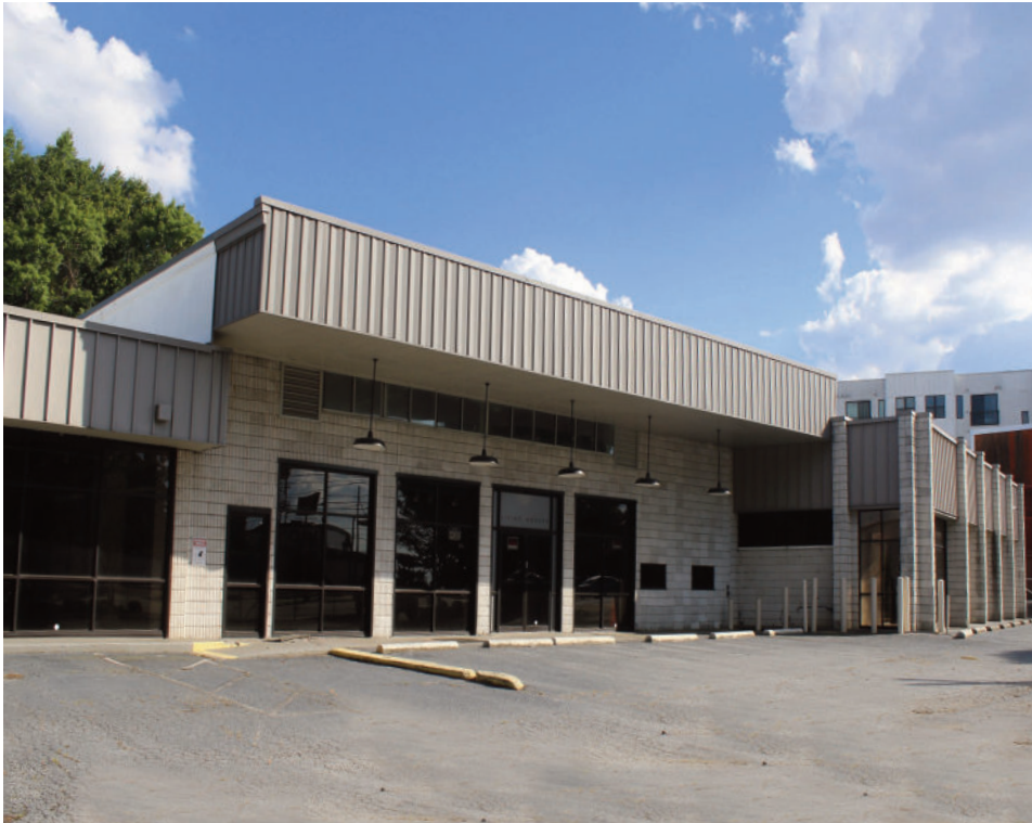
1747 Cheshire Bridge Road | Atlanta, Georgia 30324

HIGH TRAFFIC RETAIL CORRIDOR $7,250,000 OR $23.00 /SF NNN