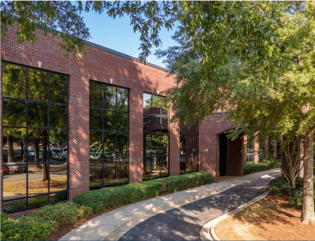
10700 Medlock Bridge Road | Johns Creek, GA 30097