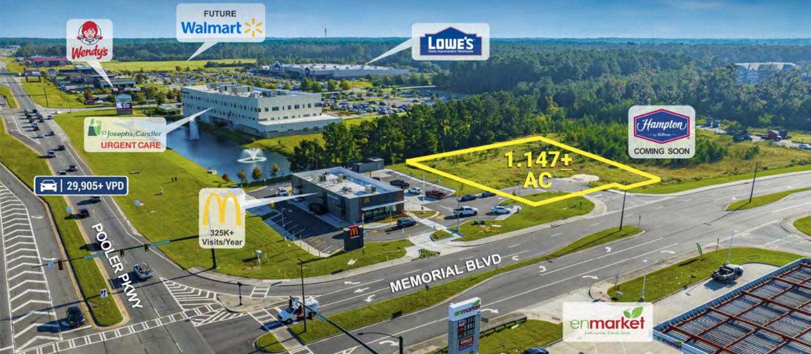
Memorial Boulevard | Pooler, Georgia 31322