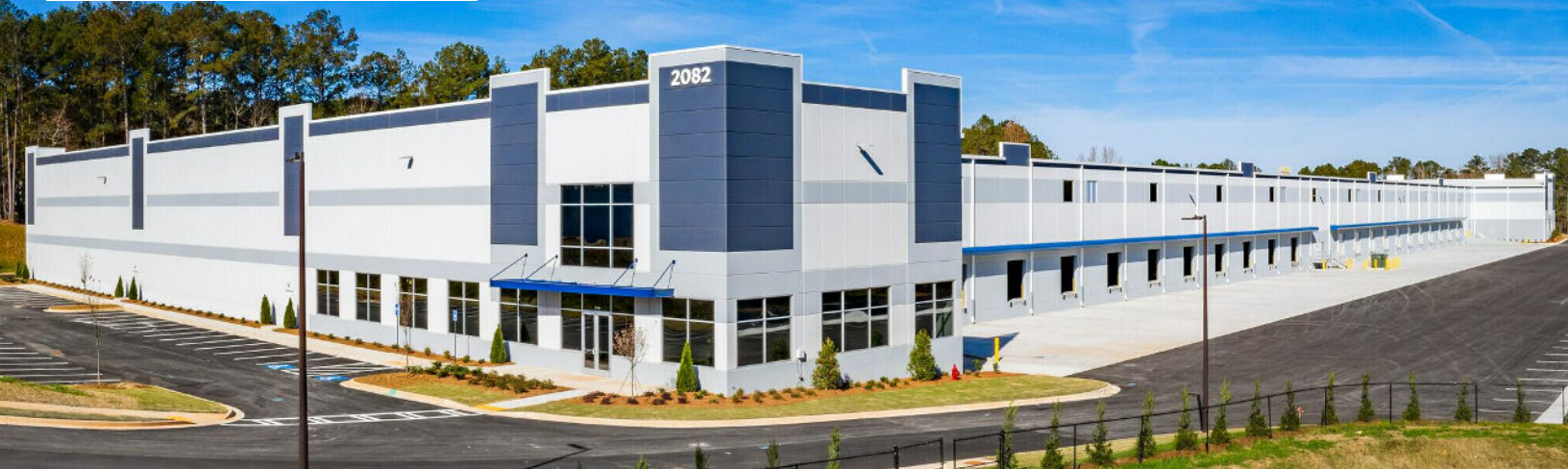
2082 East Park Drive | Conyers, Georgia 30013