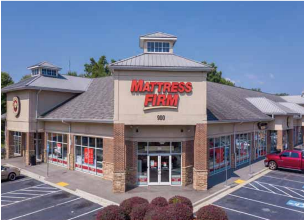
900 Duluth Highway | Lawrenceville, Georgia 30043