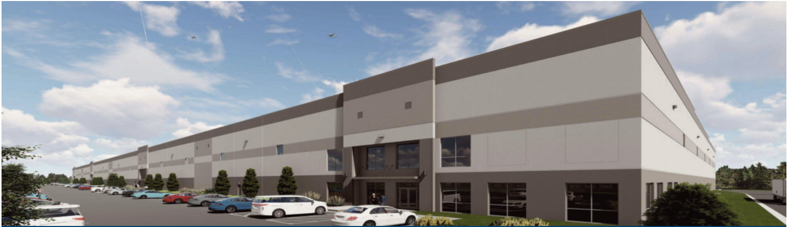
18139 Logistics Parkway, NE | Covington, GA 30014