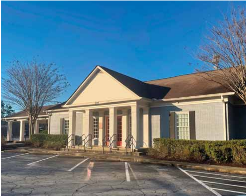
6344 Roswell Road NE | Sandy Springs, GA 30328