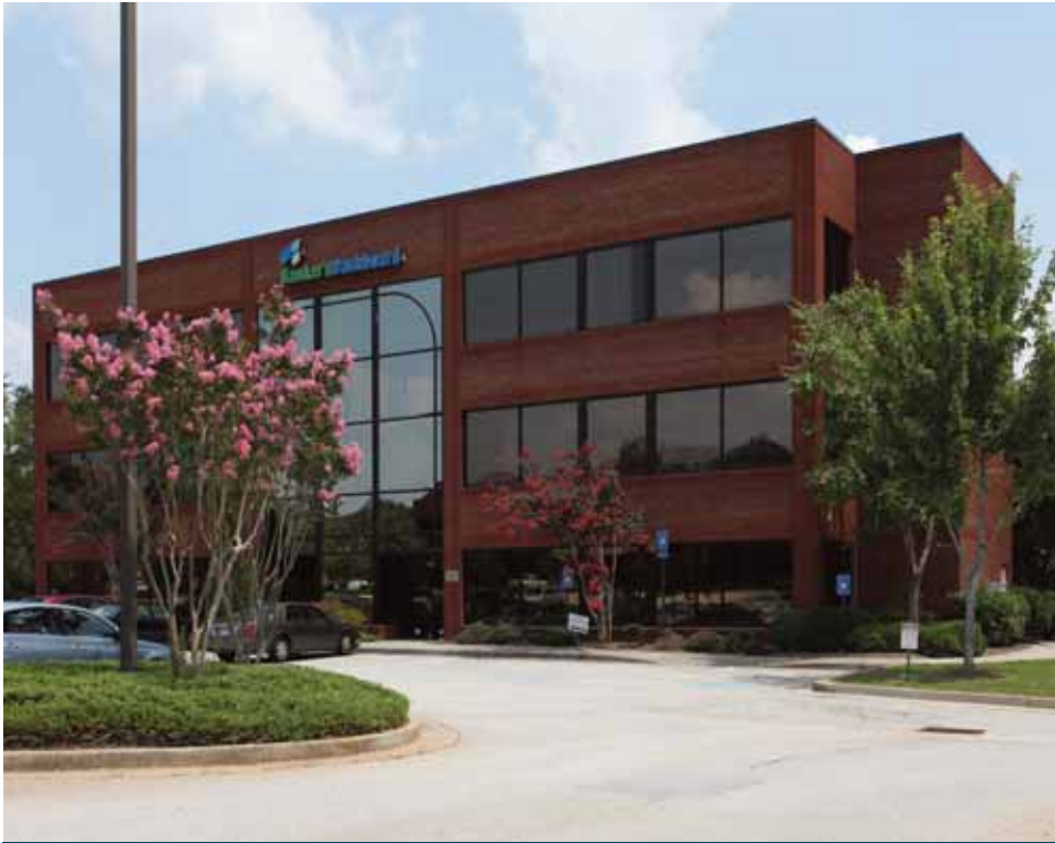
825 Fairways Court | Stockbridge, GA 30281