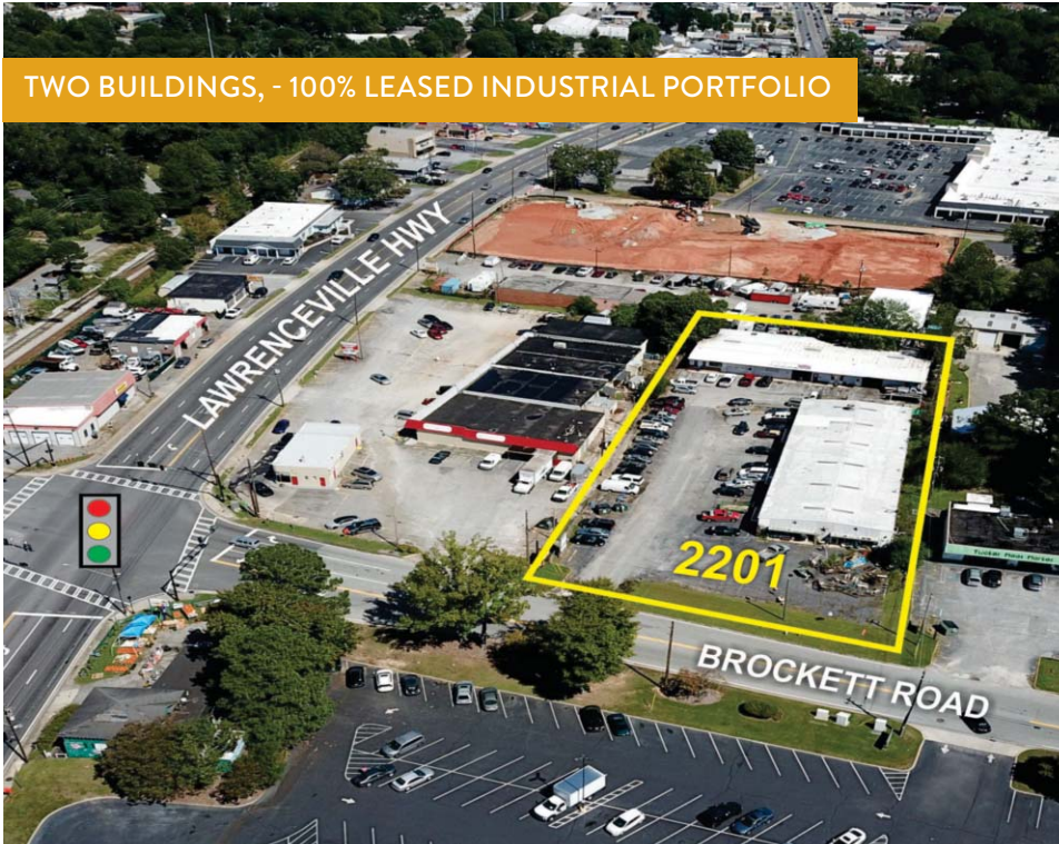
2201 BROCKETT ROAD | TUCKER GA, 30084

TWO BUILDINGS, - 100% LEASED INDUSTRIAL PORTFOLIO