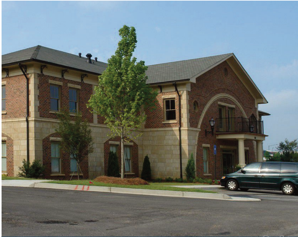
1325 Satellite Boulevard | Building 100 | Suite 102 | Suwanee, GA 30024