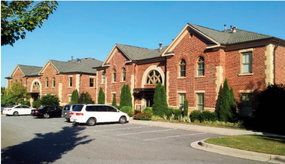
1325 Satellite Boulevard | Building 600 | Suite 605 | Suwanee, GA 30024