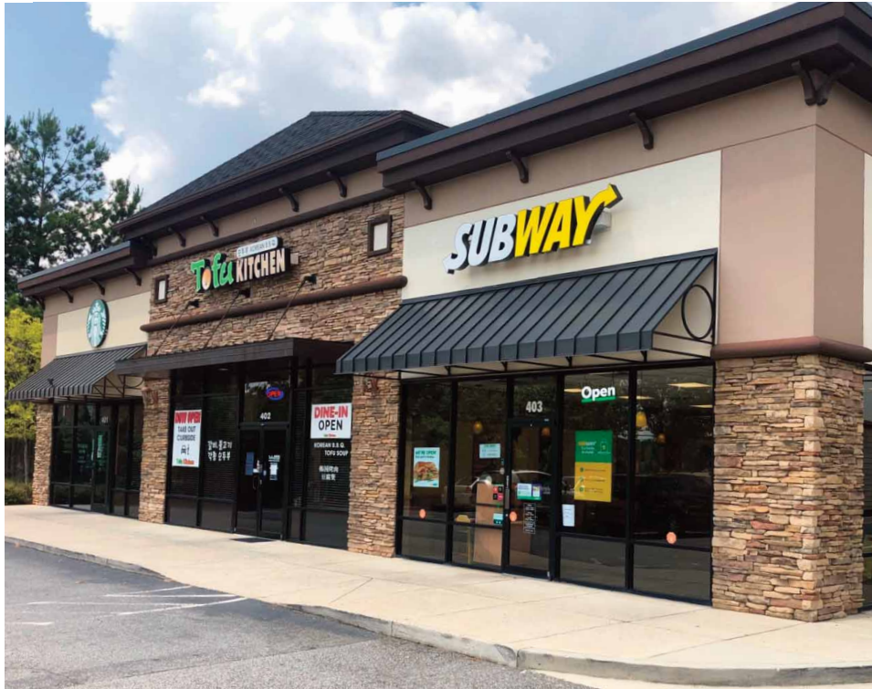
10900 Medlock Bridge Road | Duluth, Georgia 30097