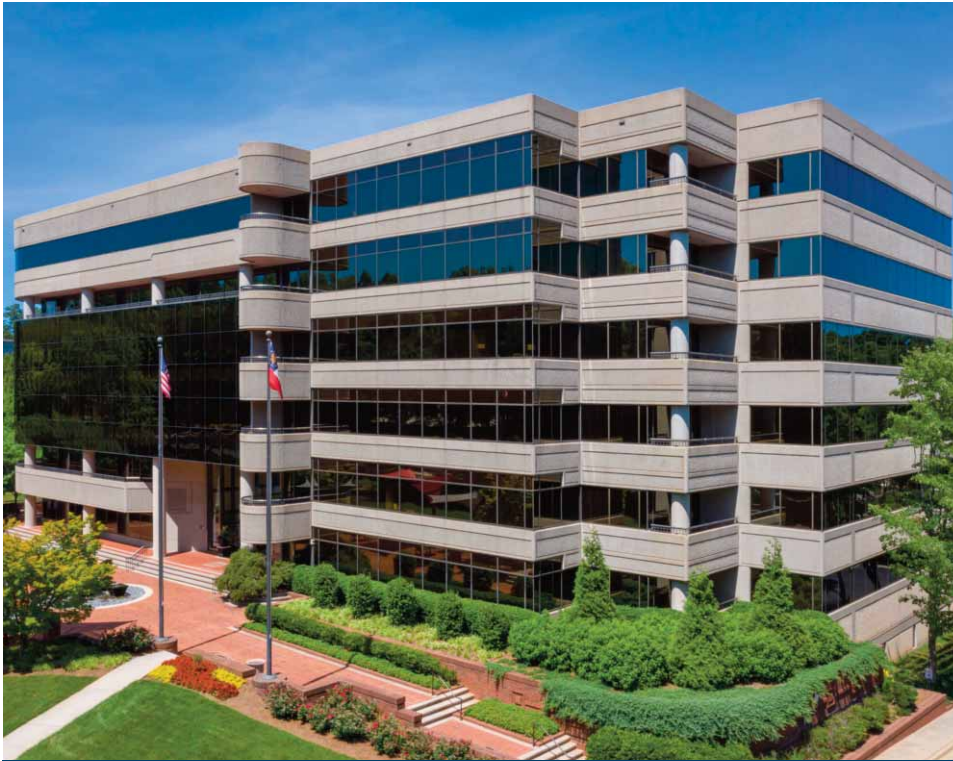
6600 Peachtree Dunwoody Rd, Bldg 600, Suite 305 | Atlanta, GA 30328