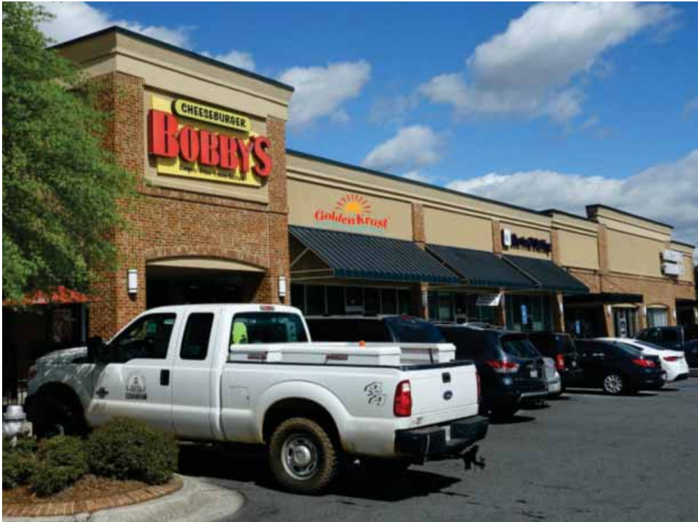
5077 Jimmy Lee Smith Parkway | Hiram, GA 30141