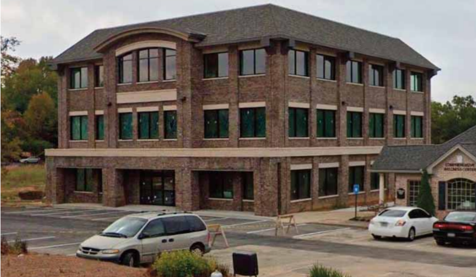
2008 Lawrenceville-Suwanee Rd | Suwanee, GA 30024