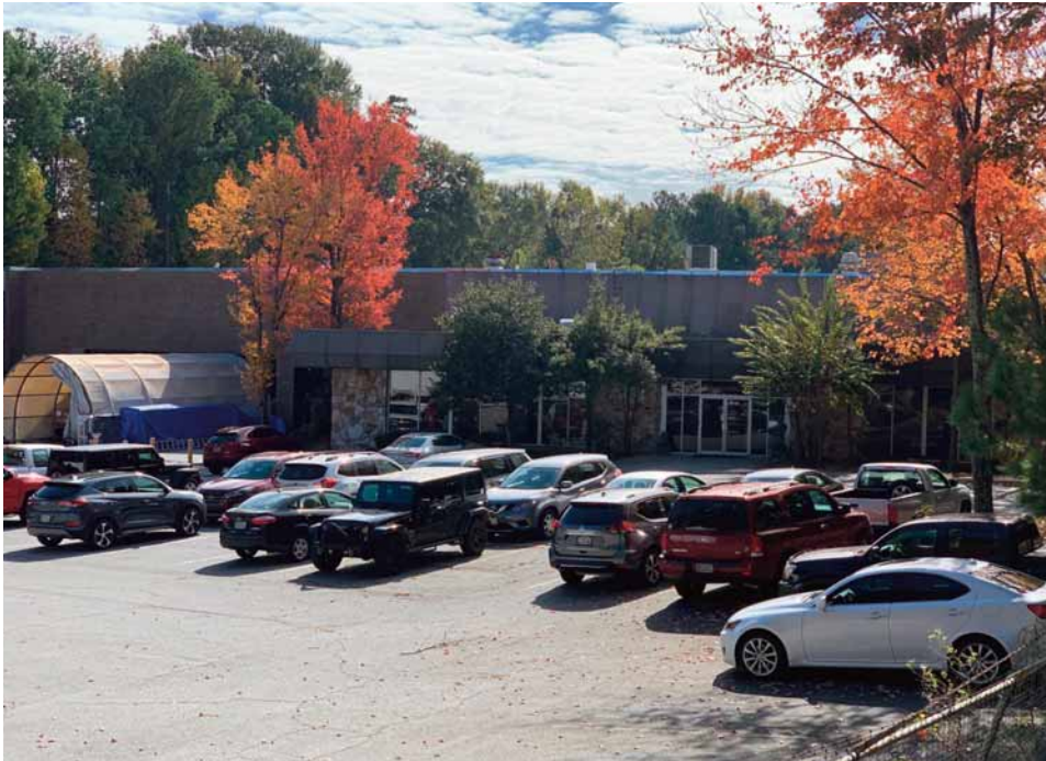
1990 Defoor Ave NW | Atlanta, GA 30318