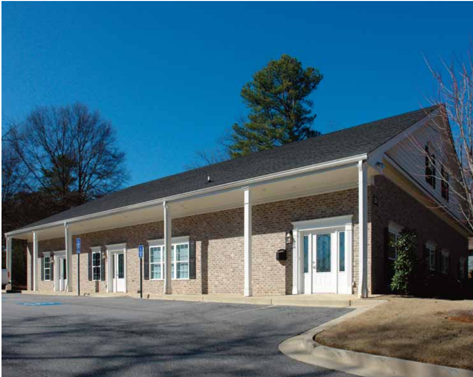
3347 Duluth Highway 120 | Duluth, Georgia 30096