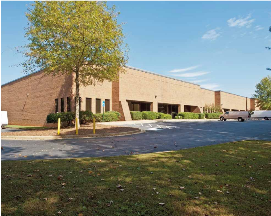
2197 Canton Road | Marietta, GA 30066