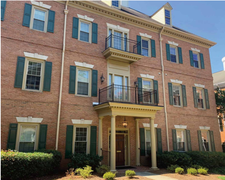
2915 Piedmont Road | Atlanta, Georgia 30305