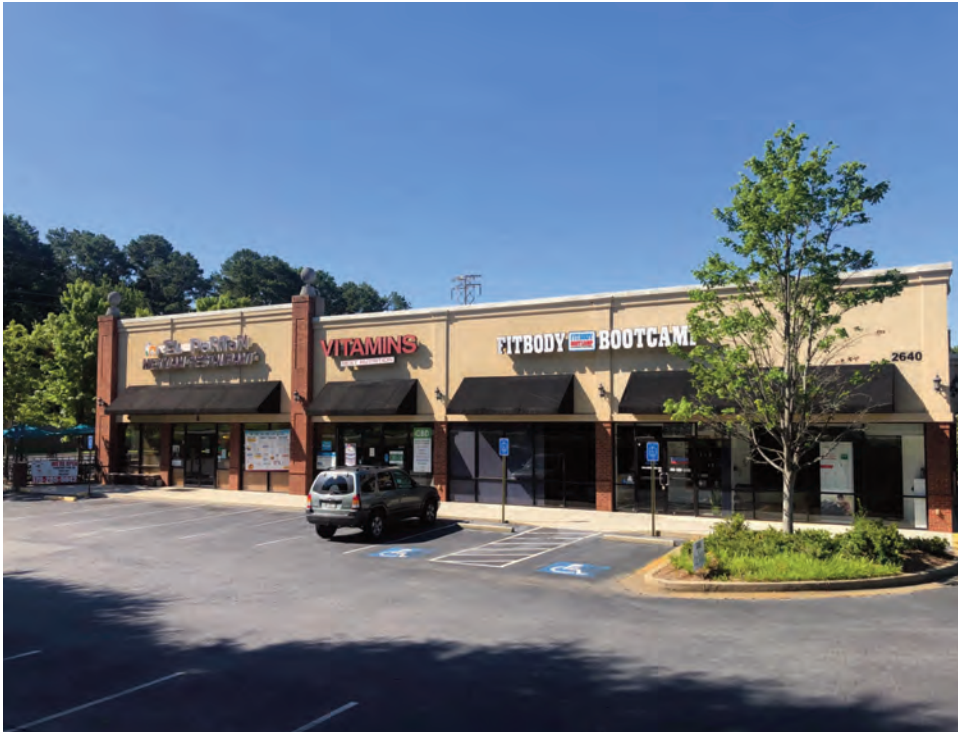
2640 Old Peachtree Road | Duluth, GA 30097