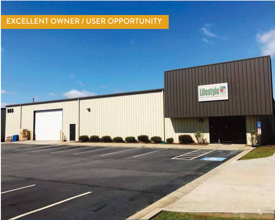
955 Patrick Industrial Court | Winder, GA 30680