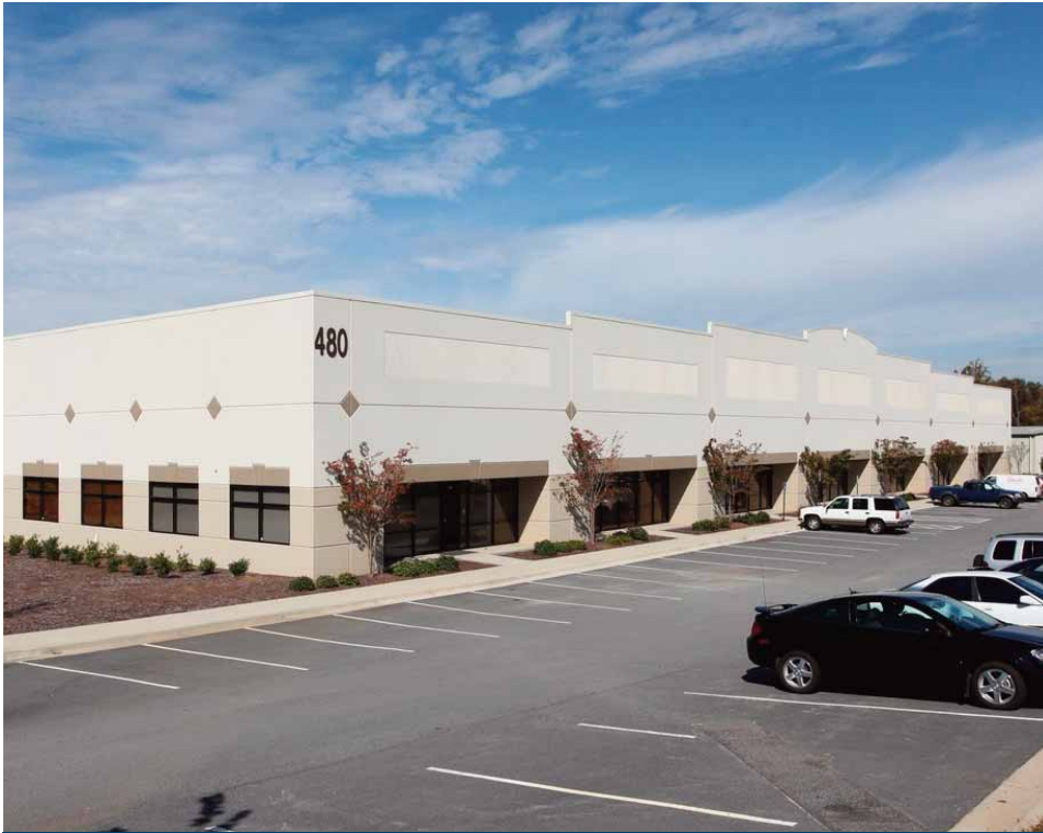
480 Brogdon Road | Suwanee, Georgia 30024