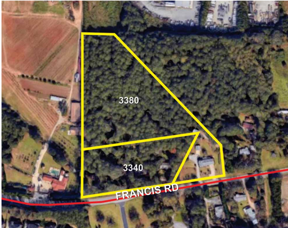
3340 & 3380 Francis Road | Alpharetta, Georgia 30004