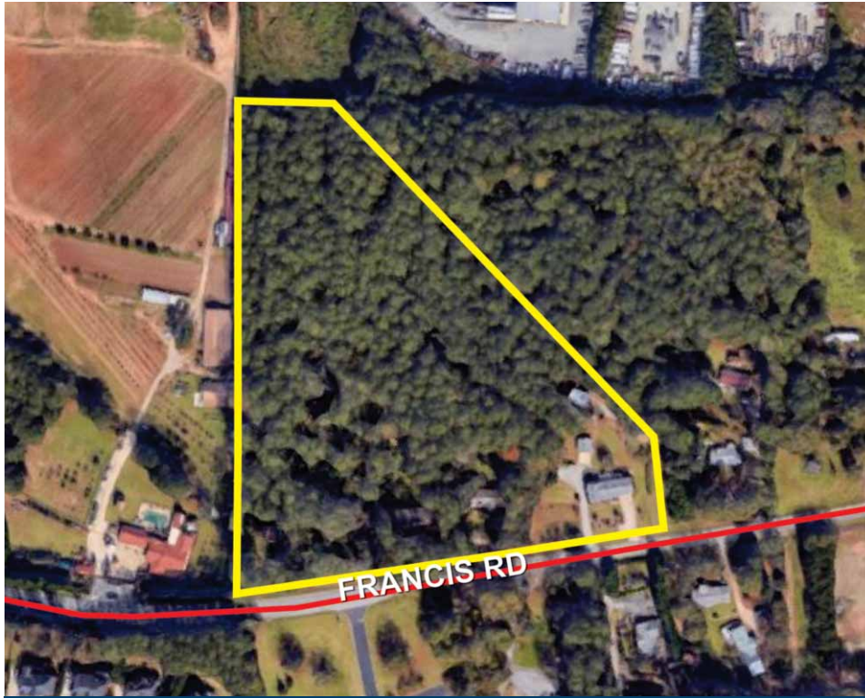
3340 & 3380 Francis Road | Alpharetta, Georgia 30004