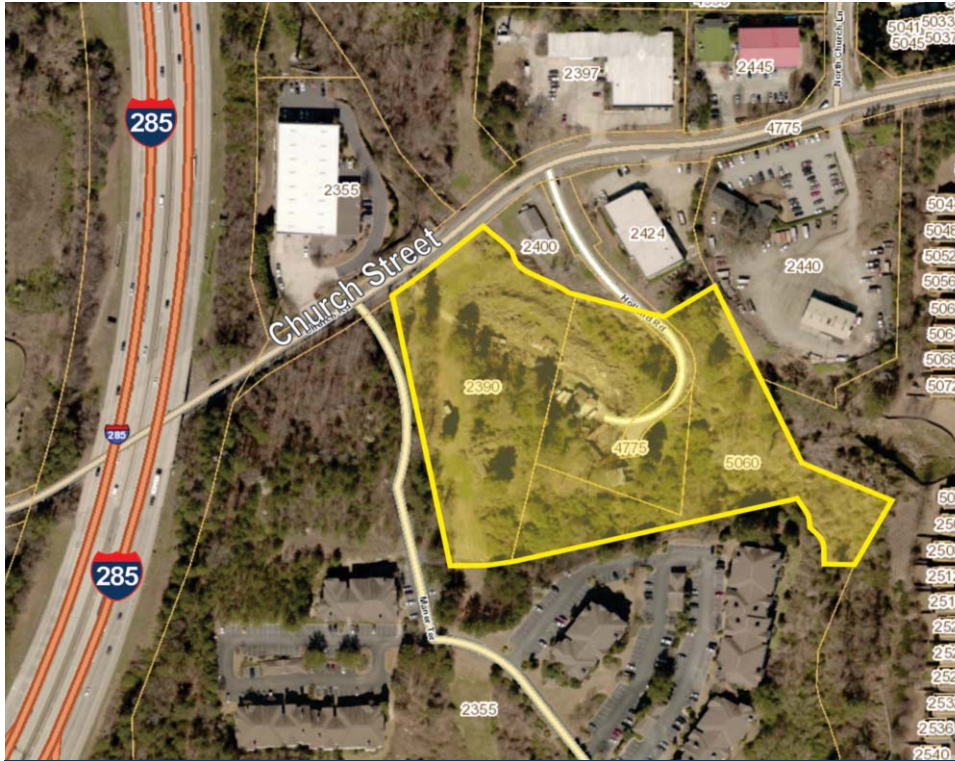
0 Church Road | Atlanta, Georgia 30339