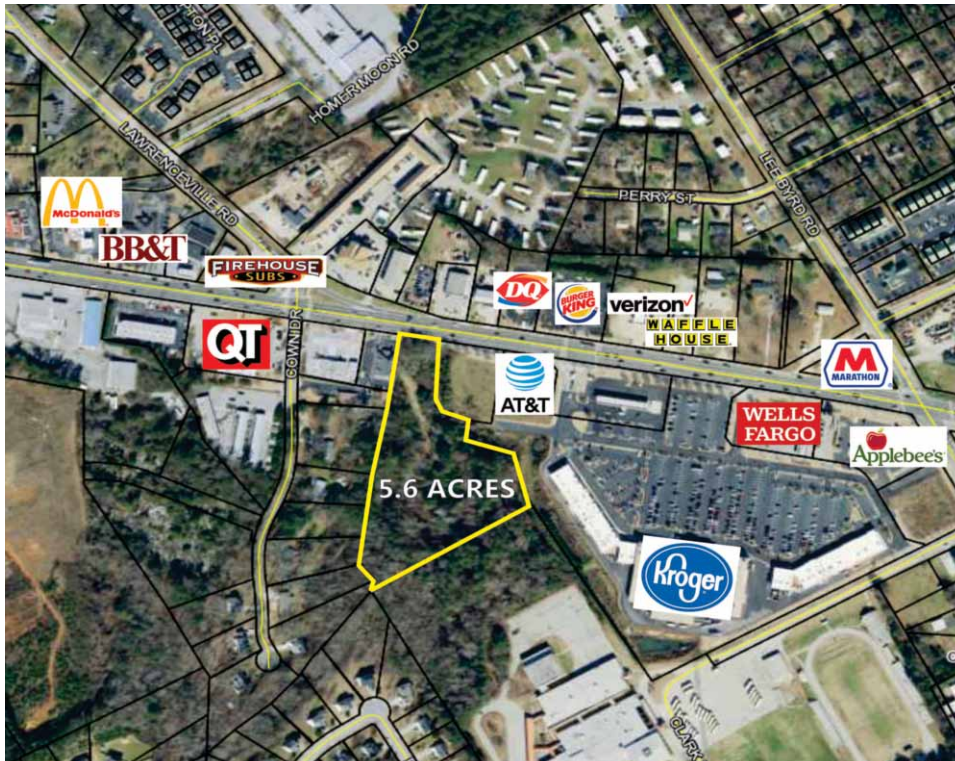
4715 Atlanta Highway | Loganville, Georgia 30052