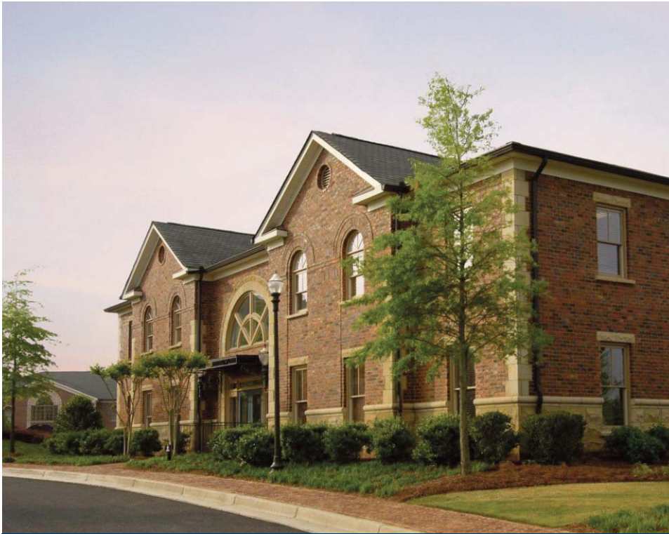
1325 Satellite Boulevard, Building 800 | Suwanee, GA 30024