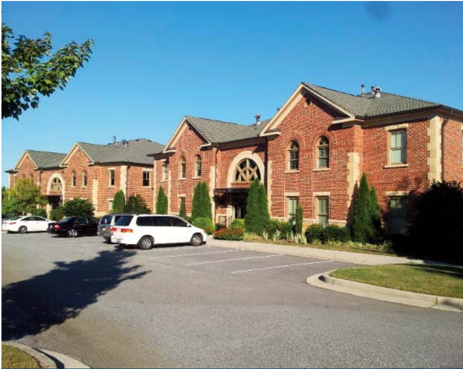
1325 Satellite Boulevard, Suite 606 | Suwanee, GA 30024