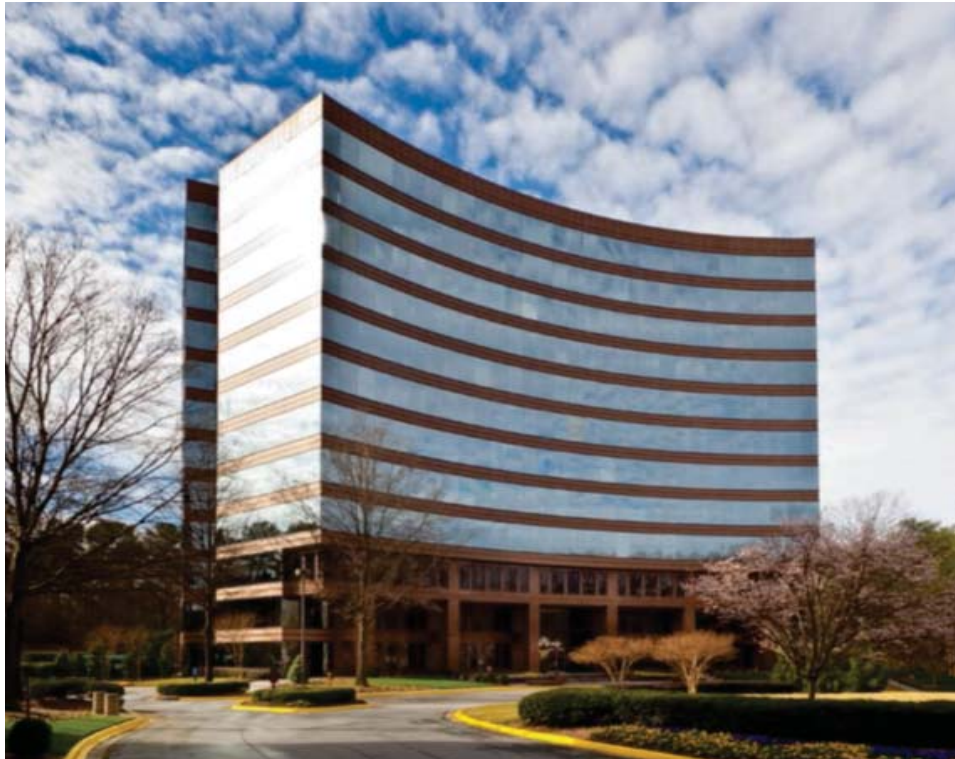
1850 Parkway Place, Suite 500 | Marietta, GA 30067