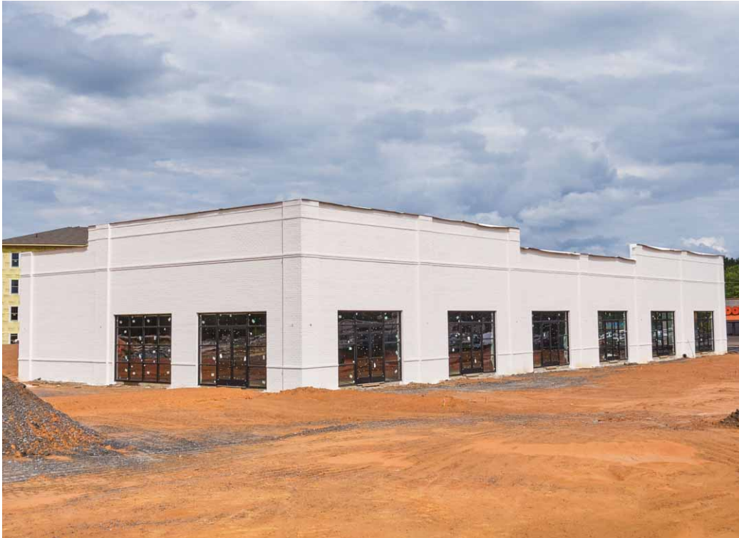
2101 Old 41 Highway | Kennesaw, GA 30144 | 34.005014, -84.600056

1,500 - 10,000 SF RETAIL or PAD SITE AVAILABLE