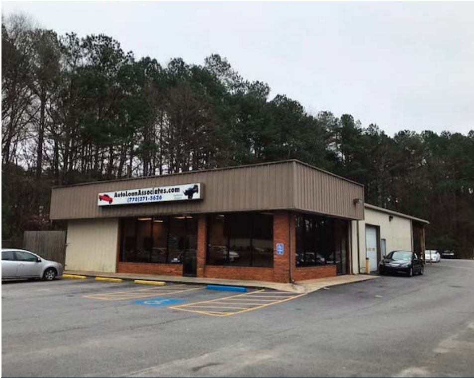
1886 Lawrenceville Highway | Lawrenceville, GA 30044

± 5,000 SF Office/Warehouse Retail Building with Fenced Outside Storage for Sale