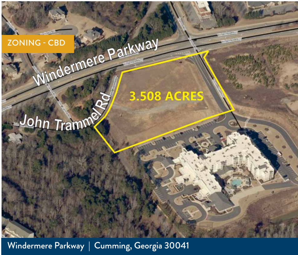
Windermere Parkway | Cumming, Georgia 30041