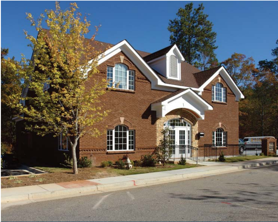
925 River Centre Place | Lawrenceville, Georgia 30043

925 RIVER CENTRE PLACE | LAWRENCEVILLE, GEORGIA