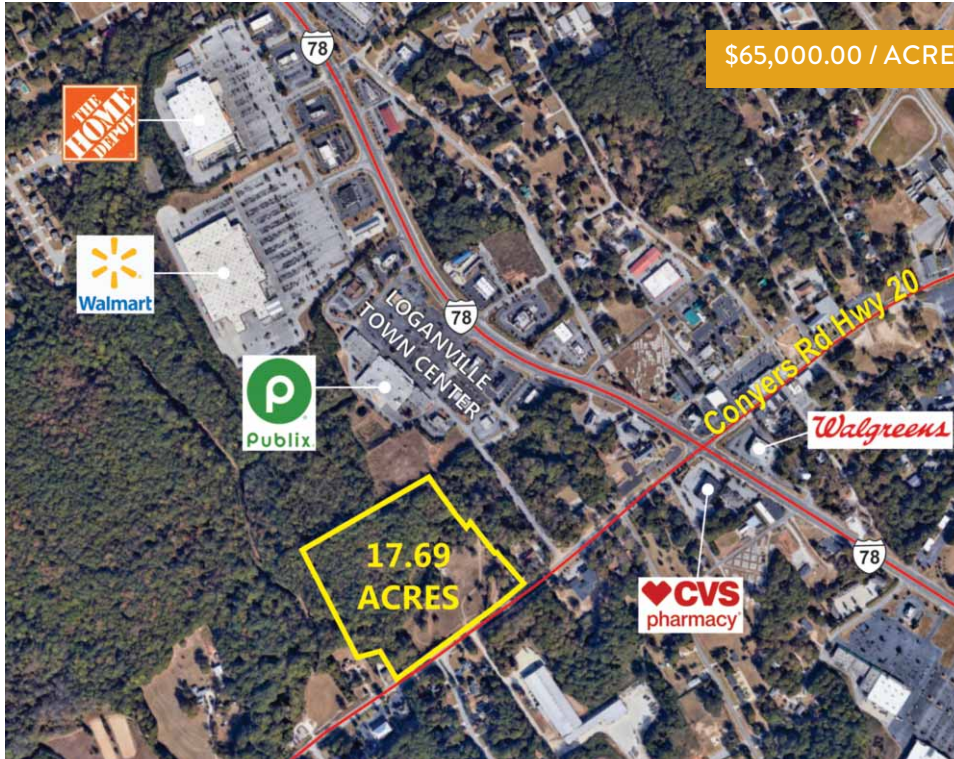
443 Conyers Road | Loganville, Georgia 30052