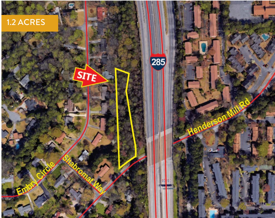
3186 Henderson Mill Road | Atlanta, GA 30341