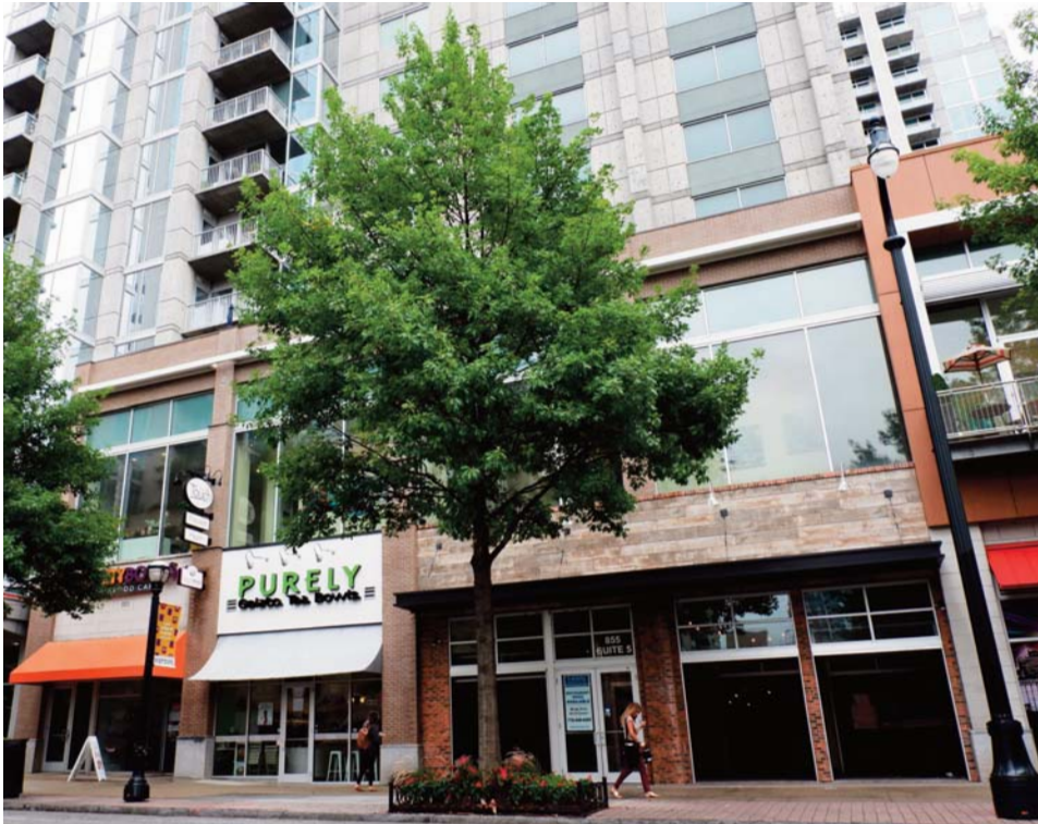
855 Peachtree Street NE | Atlanta, GA 30308 | 33.777881, -84.384200