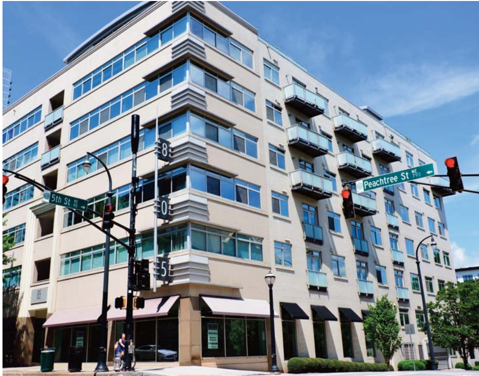
805 Peachtree Street NE | Atlanta, GA 30308 | 33.776535, -84.384026