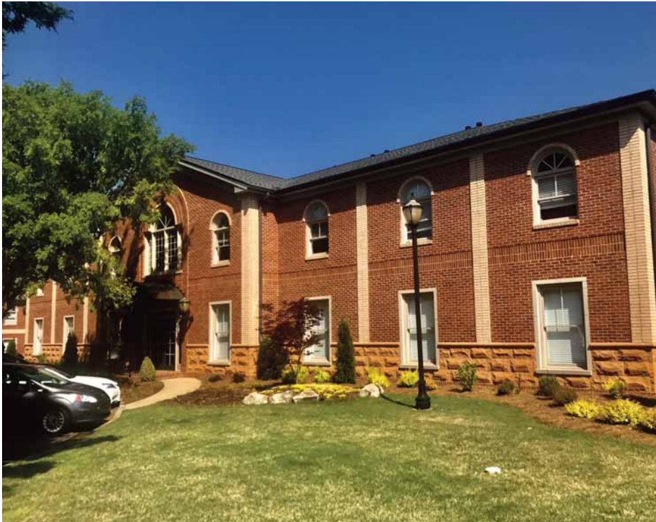
4080 McGinnis Ferry Road, Building 1000 | Alpharetta, GA 30005