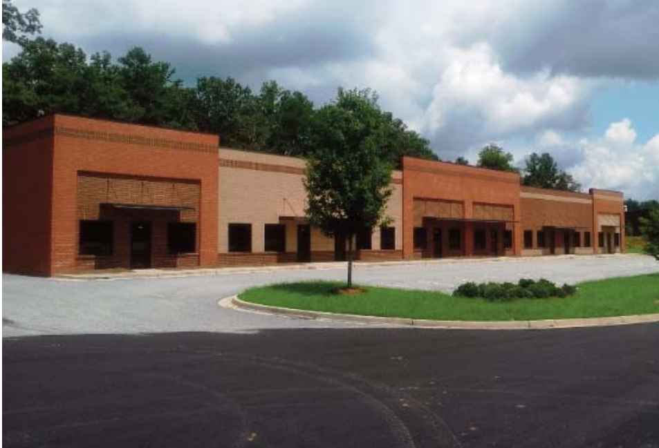
Grogan Business Park | Dawsonville, Georgia